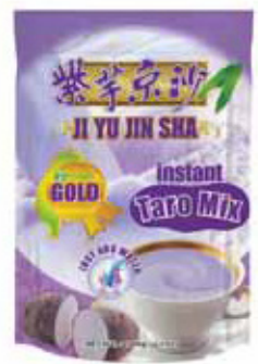
TARO GOLD POWDER 2.2 lbs (1 kg) Shelf Life - 18 Months