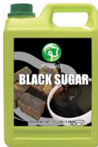
BLACK SUGAR 5.5 lbs (2.5 kg) Shelf Life - 1 Year