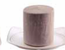
Taro Block 2200 g (2.2 kg) Shelf Life - 1 Year