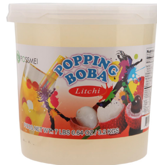
Popping Boba - Litchi 3.2 kg Shelf Life - 1 Year