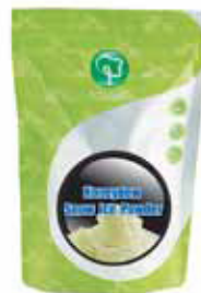
HONEYDEW SNOW ICE POWDER 2.2 lbs (1 kg) Shelf Life - 1 Year