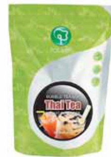
THAI TEA 2.2 lbs (1 kg) Shelf Life - 18 Months