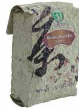
OOLONG GREEN TEA 1.32 lbs (600 g) Shelf Life - 2 Years