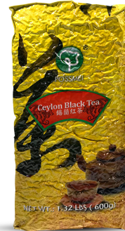
Ceylon Black Tea 600g Shelf Life - 2 Years