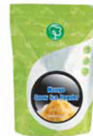
MANGO SNOW ICE POWDER 2.2 lbs (1 kg) Shelf Life - 1 Year