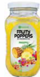
Pineapple 395 g Shelf Life - 1 Year