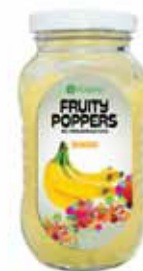
Banana 395 g Shelf Life - 1 Year