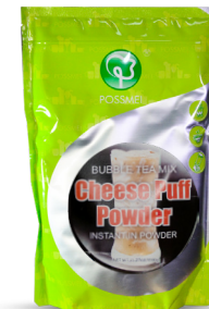
Cheese Puff Powder 1 kg Shelf Life - 18 Months