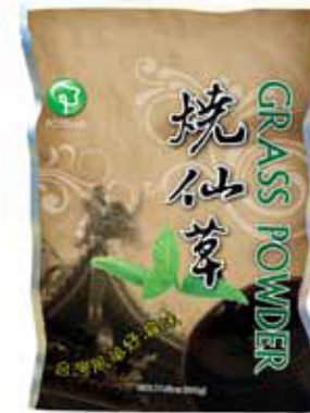
GRASS JELLY POWDER 1.1 lbs (500 g) Shelf Life - 18 Months