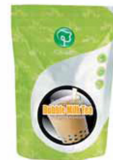
BUBBLE TEA ALL IN 1 2.2 lbs (1 kg) Shelf Life - 18 Months