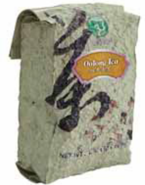
OOLONG TEA 1.32 lbs (600 g) Shelf Life - 2 Years