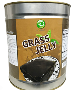
Grass Jelly Can 3 kg Shelf Life - 2 Years