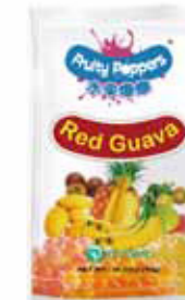
Red Guava 2.2 lbs (1 kg) Shelf Life - 1 Year