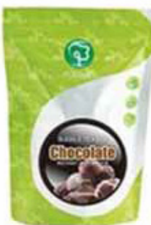
CHOCOLATE POWDER 2.2 lbs (1 kg) Shelf Life - 18 Months