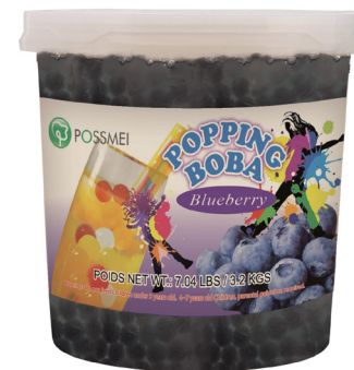
Popping Boba - Blueberry 3.2 kg Shelf Life - 1 Year