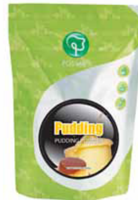
EGG PUDDING POWDER 2.2 lbs (1 kg) Shelf Life - 18 Months