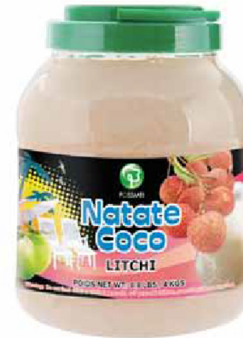
LITCHI NATA (LYCHEE) 8.8 lbs (4 kg) Shelf Life - 1 Year