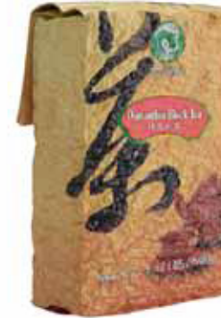
OSMANTHUS TEA 1.32 lbs (600 g) Shelf Life - 2 Years