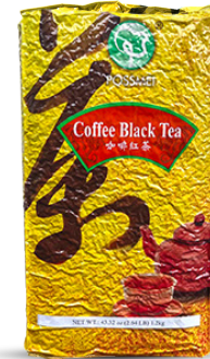
Coffee Black Tea 1200g Shelf Life - 2 Years