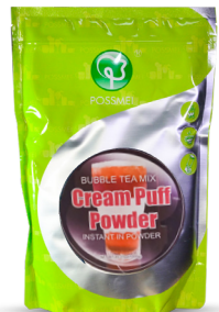
Cream Puff Powder 1 kg Shelf Life - 18 Months