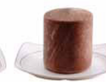
Chocolate Block 2200 g (2.2 kg) Shelf Life - 1 Year