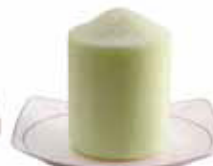
Honeydew Block 2200 g (2.2 kg) Shelf Life - 1 Year