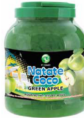
GREEN APPLE NATA 8.8 lbs (4 kg) Shelf Life - 1 Year