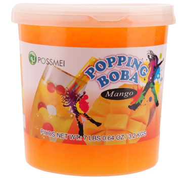
Popping Boba - Mango 3.2 kg Shelf Life - 1 Year