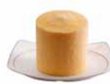
Mango Block 2200 g (2.2 kg) Shelf Life - 1 Year