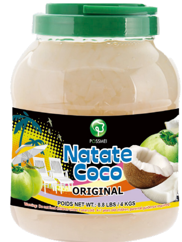
NATATE COCO ORIGINAL 8.8 lbs (4 kgs) Shelf Life -1 Year