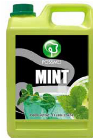
MINT 5.5 lbs (2.5 kg) Shelf Life - 1 Year