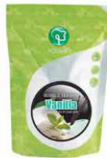
VANILLA POWDER 2.2 lbs (1 kg) Shelf Life - 18 Months