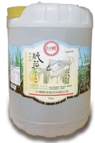
CANE SUGAR 55 lbs (25 kg) Shelf life: 1 Year