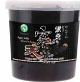
HAN TIEN JELLY BROWN SUGAR 6.8 lbs (3.1 kg) Shelf Life - 1 Year