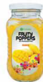
Mango 395 g Shelf Life - 1 Year