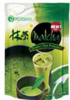
MATCHA GREEN TEA 2.2 lbs (1 kg) Shelf Life - 18 Months