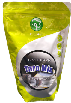
TARO POWDER 2.2 lbs (1 kg) Shelf Life - 18 Months