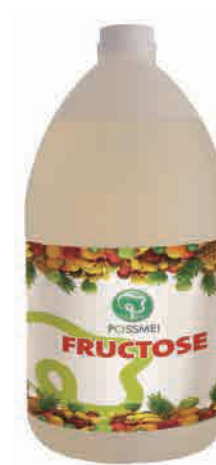
FRUCTOSE 11 lbs (5 kg) Shelf Life - 2 Years