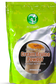
Cream Brulee Powder 1 kg Shelf Life - 18 Months