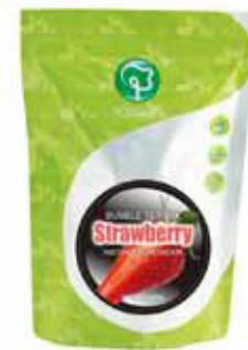
STRAWBERRY POWDER 2.2 lbs (1 kg) Shelf Life - 18 Months