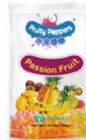
Passion Fruit 2.2 lbs (1 kg) Shelf Life - 1 Year