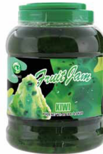
KIWI JAM 9.9 lbs (4.5 kg) Shelf Life - 1 Year