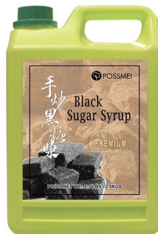
PREMIUM BLACK SUGAR SYRUP 5.5 lbs (2.5 kg) Shelf Life - 1 Year