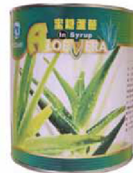
ALOE VERA 7.4 lbs (3.4 kg) Shelf Life - 2 Years