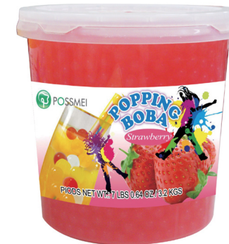
Popping Boba - Strawberry 3.2 kg Shelf Life - 1 Year