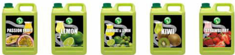
PASSION FRUIT JUICE 5.5 lbs (2.5 kg) Shelf Life - 1 Year LEMON JUICE 5.5 lbs (2.5 kg) Shelf Life - 1 Year KUMQUAT & LEMON 5.5 lbs (2.5 kg) Shelf Life - 1 Year KIWI JUICE 5.5 lbs (2.5 kg) Shelf Life - 1 Year STRAWBERRY JUICE 5.5 lbs (2.5 kg) Shelf Life - 1 Year