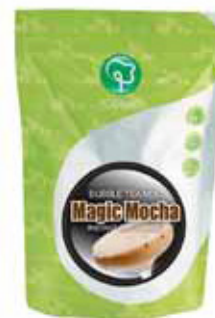
MAGIC MOCHA POWDER 2.2 lbs (1 kg) Shelf Life - 18 Months