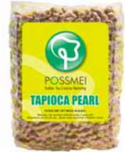
TAPIOCA PEARL 6.71 lbs (3.05 kg) Shelf Life - 1 Year