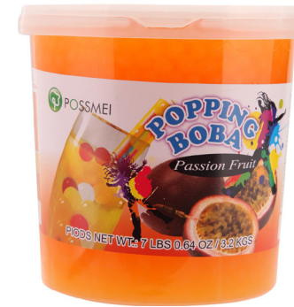
Popping Boba - Passion Fruit 3.2 kg Shelf Life - 1 Year