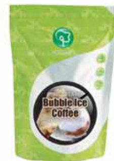
BUBBLE ICE COFFEE 2.2 lbs (1 kg) Shelf Life - 18 Months