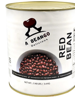
RED BEAN 7.4 Lbs (3.4 kg) Shelf Life - 2 Years