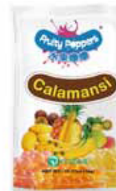
Calamansi 2.2 lbs (1 kg) Shelf Life - 1 Year