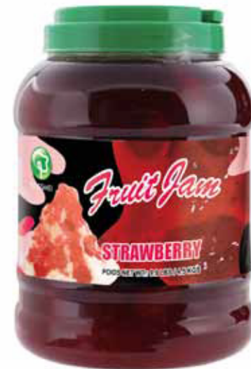
STRAWBERRY JAM 9.9 lbs (4.5 kg) Shelf Life - 1 Year