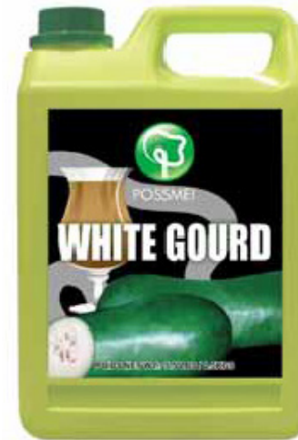
WINTERMELON 5.5 lbs (2.5 kg) Shelf Life - 1 Year