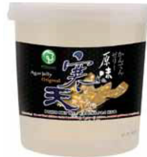
HAN TIEN JELLY ORIGINAL 6.8 lbs (3.1 kg) Shelf Life - 1 Year