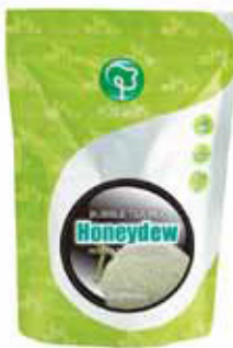
HONEYDEW POWDER 2.2 lbs (1 kg) Shelf Life - 18 Months