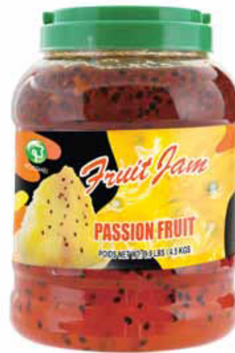
PASSION FRUIT JAM 9.9 lbs (4.5 kg) Shelf Life - 1 Year