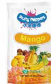
Mango 2.2 lbs (1 kg) Shelf Life - 1 Year