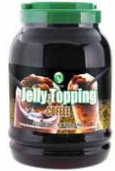
COFFEE JELLY 8.36 lbs (3.8 kg) Shelf Life - 1 Year