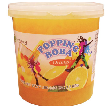
Popping Boba - Orange 3.2 kg Shelf Life - 1 Year