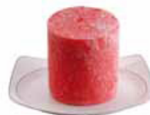
Strawberry Block 2200 g (2.2 kg) Shelf Life - 1 Year