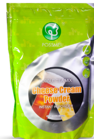
Cheese Cream Powder 1 kg Shelf Life - 18 Months