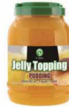
JELLY PUDDING 8.36 lbs (3.8 kg) Shelf Life - 1 Year