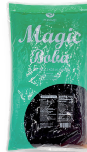
Magic Boba (Brown Sugar) 2 kg Shelf Life - 1 Year