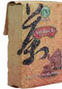
ASSAM BLACK TEA 1.32 lbs (600 g) Shelf Life - 2 Years