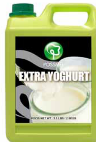
EXTRA YOGHURT 5.5 lbs (2.5 kg) Shelf Life - 1 Year