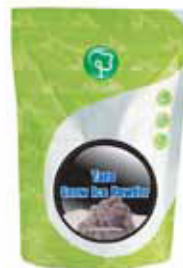
TARO SNOW ICE POWDER 2.2 lbs (1 kg) Shelf Life - 1 Year