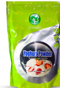
Yoghurt Powder 1 kg Shelf Life - 18 Months