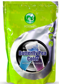
Butterfly Pea Color 1 kg Shelf Life - 18 Months