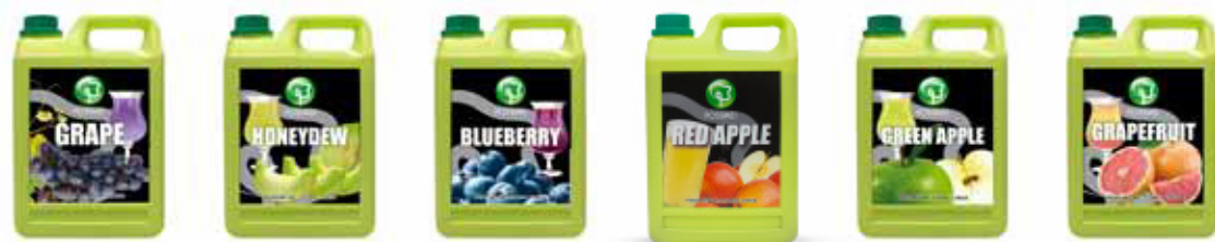
GRAPE JUICE 5.5 lbs (2.5 kg) Shelf Life - 1 Year HONEYDEW JUICE 5.5 lbs (2.5 kg) Shelf Life - 1 Year BLUEBERRY JUICE 5.5 lbs (2.5 kg) Shelf Life - 1 Year RED APPLE 5.5 lbs (2.5 kg) Shelf Life - 1 Year GREEN APPLE JUICE 5.5 lbs (2.5 kg) Shelf Life - 1 Year GRAPEFRUIT JUICE 5.5 lbs (2.5 kg) Shelf Life - 1 Year