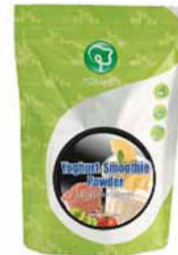
YOGHURT SMOOTHIE POWDER 2.2 lbs (1 kg) Shelf Life - 18 Months