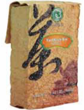
EARL GREY TEA 1.32 lbs (600 g) Shelf Life - 2 Years