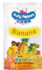
Banana 2.2 lbs (1 kg) Shelf Life - 1 Year