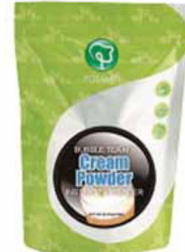
CREAM POWDER 2.2 lbs (1 kg) Shelf Life - 18 Months