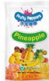
Pineapple 2.2 lbs (1 kg) Shelf Life - 1 Year