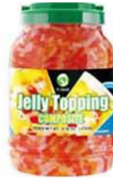
COMPOSITE JELLY 8.36 lbs (3.8 kg) Shelf Life - 1 Year