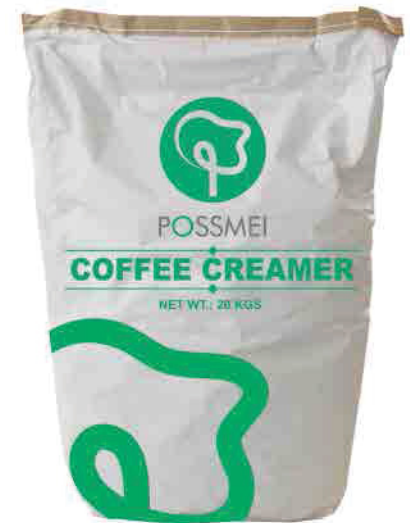
NON-DAIRY CREAMER 44 lbs (20 kg) Shelf Life - 18 Months