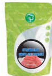
STRAWBERRY SNOW ICE POWDER 2.2 lbs (1 kg) Shelf Life - 1 Year