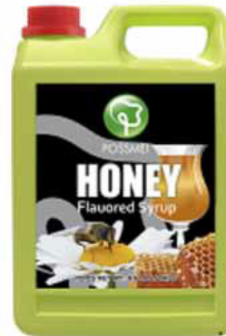
HONEY FLAVORED SYRUP 6.6 lbs (3 kg) Shelf Life - 3 Years