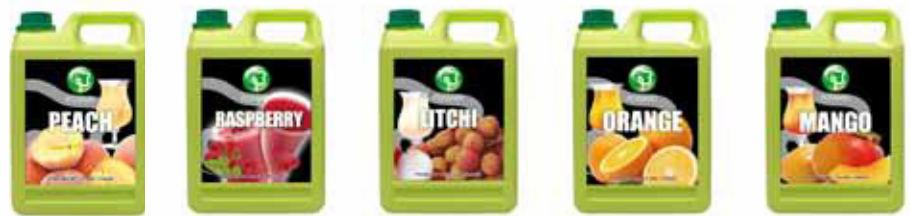
PEACH JUICE 5.5 lbs (2.5 kg) Shelf Life - 1 Year RASPBERRY 5.5 lbs (2.5 kg) Shelf Life - 1 Year LITCHI JUICE 5.5 lbs (2.5 kg) Shelf Life - 1 Year ORANGE JUICE 5.5 lbs (2.5 kg) Shelf Life - 1 Year MANGO JUICE 5.5 lbs (2.5 kg) Shelf Life - 1 Year