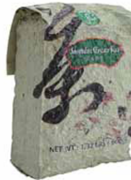
JASMINE GREEN TEA 1.32 lbs (600 g) Shelf Life - 2 Years