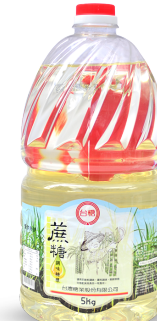
Cane Sugar Syrup 5 ks Shelf Life - 1 Year