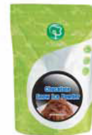
CHOCOLATE SNOW ICE POWDER 2.2 lbs (1 kg) Shelf Life - 1 Year