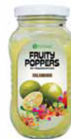
Calamansi 395 g Shelf Life - 1 Year