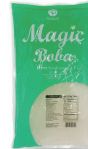
Magic Boba (Original) 2 kg Shelf Life - 1 Year