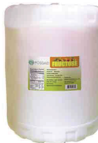
FRUCTOSE 55 lbs (25 kg) Shelf Life - 1 Year