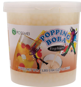
Popping Boba - Yoghurt 3.2 kg Shelf Life - 1 Year