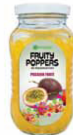
Passion Fruit 395 g Shelf Life - 1 Year