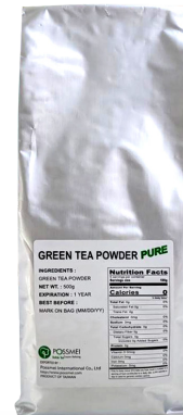
PURE GREEN TEA POWDER 1.1 lbs (500 g) Shelf Life - 1 Year