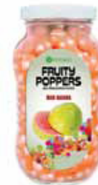
Red Guava 395 g Shelf Life - 1 Year