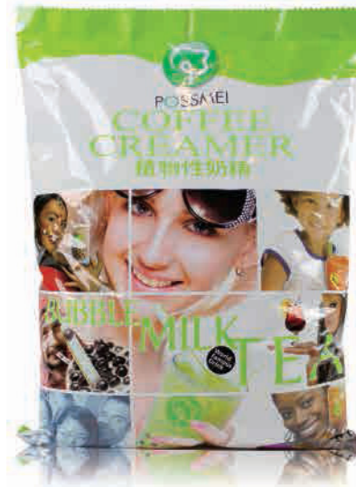
NON-DAIRY CREAMER 2.2 lbs (1 kg) Shelf Life - 18 Months